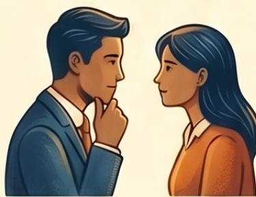
Responsibility towards the other Educating is an ethical commitment and deep care toward the student's face.