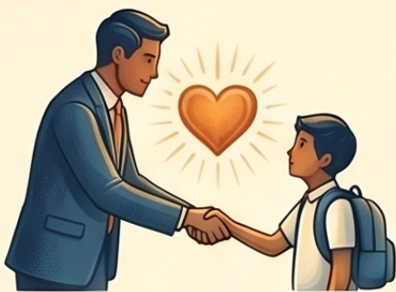
An act of love and passion Teaching is not just transmitting knowledge; it is an ethical commitment full of meaning.