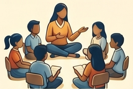
Duty comes from the classroom True teacher identity is built by listening to the student, not just by following books.